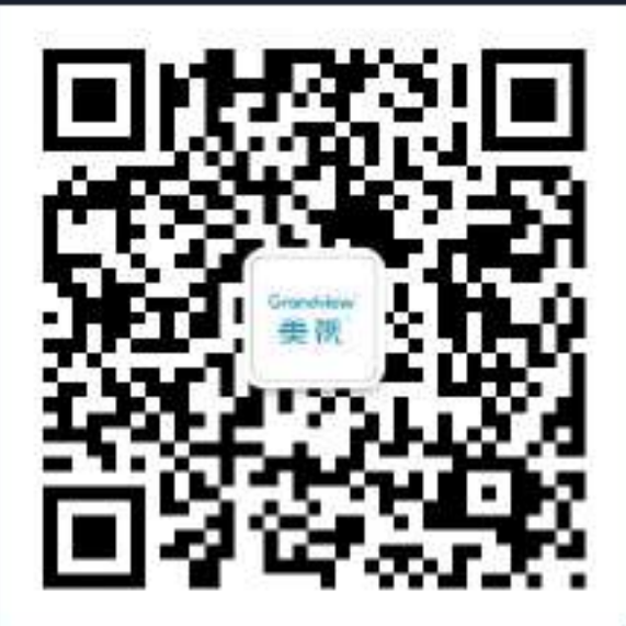
Grandview QR code Grandview wechat QR code