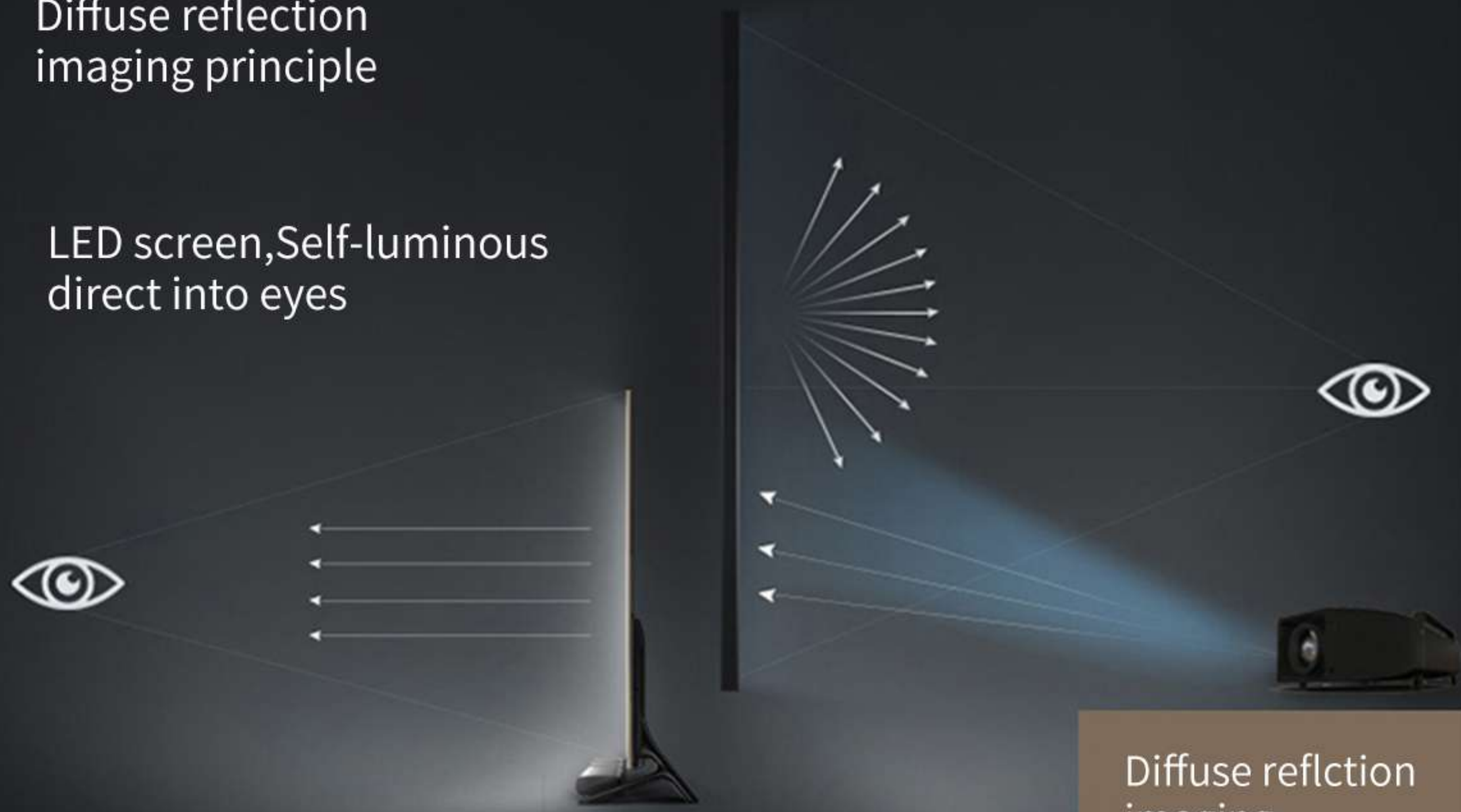
Diffuse reflection imaging

LED screen, Self-luminous direct into eyes